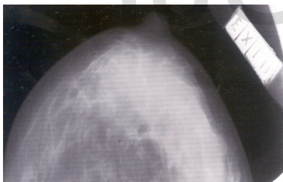
Figure 3: non-speculated, dense mass with largely indistinct borders.